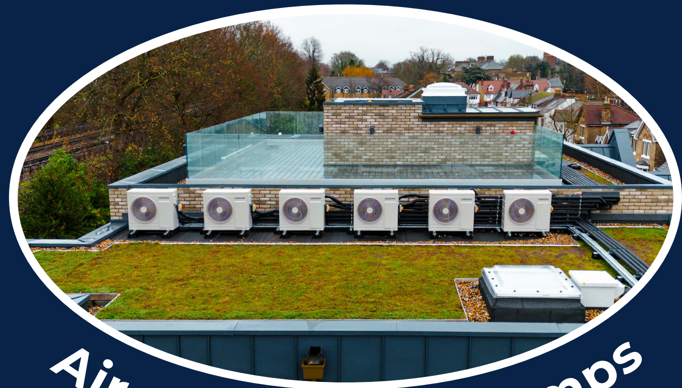
Air source heat pumps